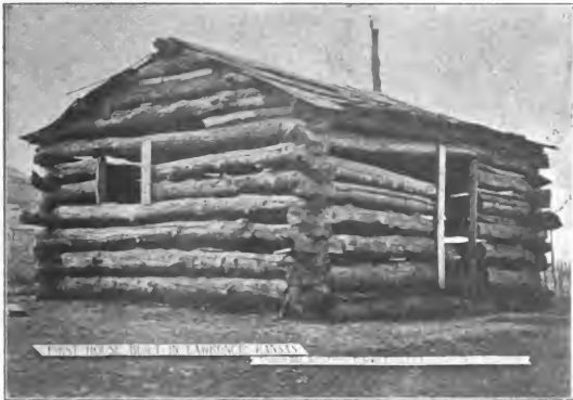
FIRST HOUSE IN LAWRENCE.